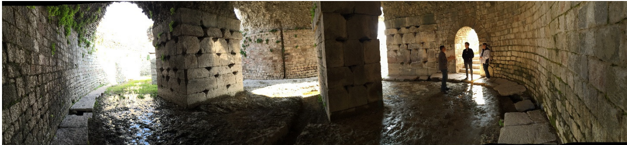
The incantation room of Asclepios

Asclepios was known to the ancients as the god of healing. People would come from all over the region to inquire to the “Lourdes of the ancient world” for their ailments. They would gather in an underground room, smoking drugs and chanting incantations. They hallucinated that Asclepios came to them in a dream and would tell them how to be healed or if their condition was fatal. It was a nice scam which generated large amounts of money for the pagans. There was a common saying during that time that “Asclepios is Lord”. Obviously this caused trouble for the Christians of Pergamum.